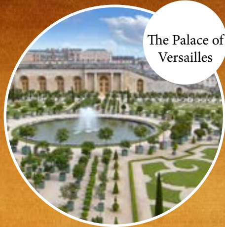
The Palace of Versailles