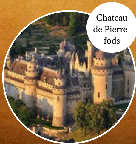
Chateau de Pierrefonds