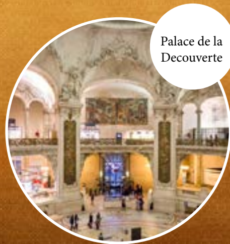
Palace de la Decouverte