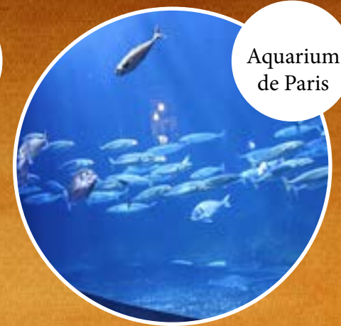
Aquarium de Paris