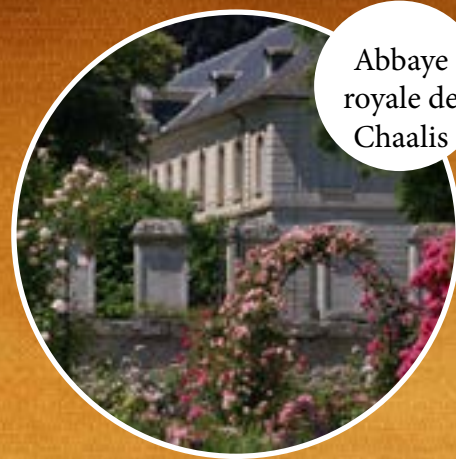
Abbaye royale de Chaalis