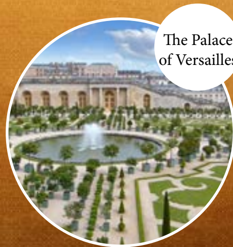
The Palace of Versailles